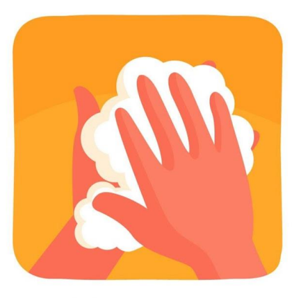
Wash hands often with soap and water