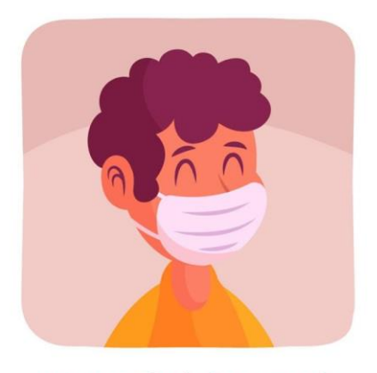
Wear a cloth face mask